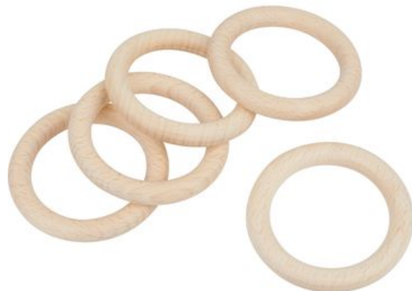
Wooden rings, Ø 70 mm, 5 pieces