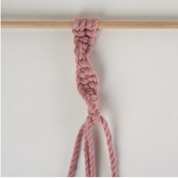
Spiral knot - turned to the left