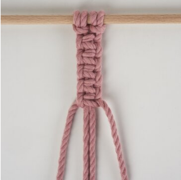
Square knot - facing right